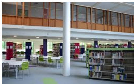
Interior of the new AIT Library