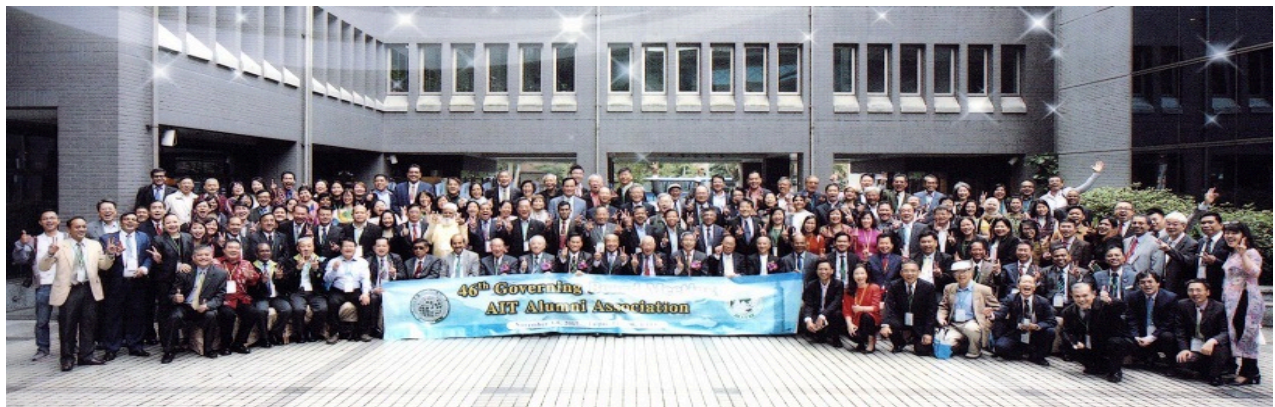
Participants at the 46 th AITAA Governing Board Meeting, Taiwan, November 2017

The Governing Board awarded 16 Distinguished Alumni Awards and one Honorary Member in this meeting. Our congratulations to all the awardees and may they continue to strive their best for the betterment of AITAA and AIT! The AITAA Indonesia Chapter will be our next host for the upcoming 47 th Governing Board Meeting. We are encouraging each one of you to support this event and we look forward to meeting you again at this meeting.