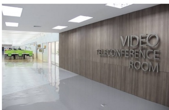
Library entrance towards the video-telecom facilities