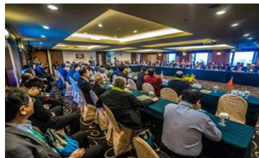
Photos at the Opening Ceremony of the 46 th AITAA Governing Board Meeting, Taiwan, November 2017