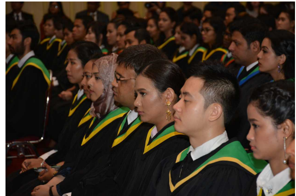
Photos at the 128 th Graduation, AIT Center Conference Center, 14 December 2017 5