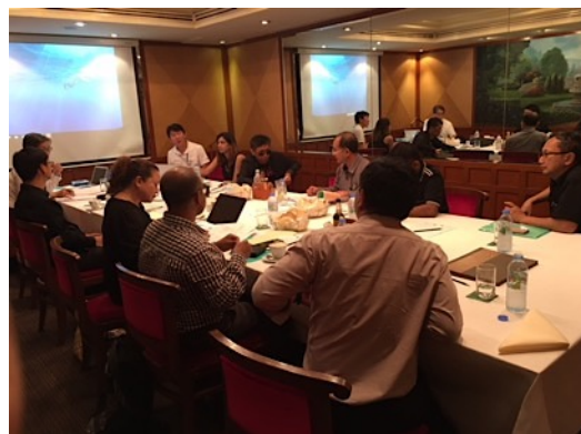
The AITAA Executive Committee at the November 2017 meeting, Bangkok