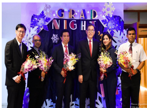
The members of the AITAA Executive Committee at the 128 th AIT Graduation Night and Induction Ceremony 8 Dec 2017 at AIT Conference Center

Postal Address: P.O. Box 4, Klong Luang Pathumthani 12120 Thailand