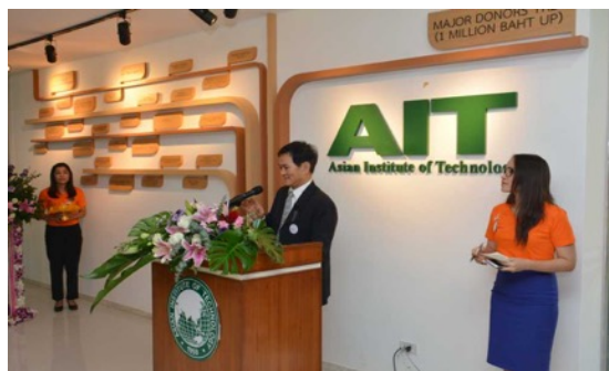
Inauguration Ceremony of new AIT Library by AIT President